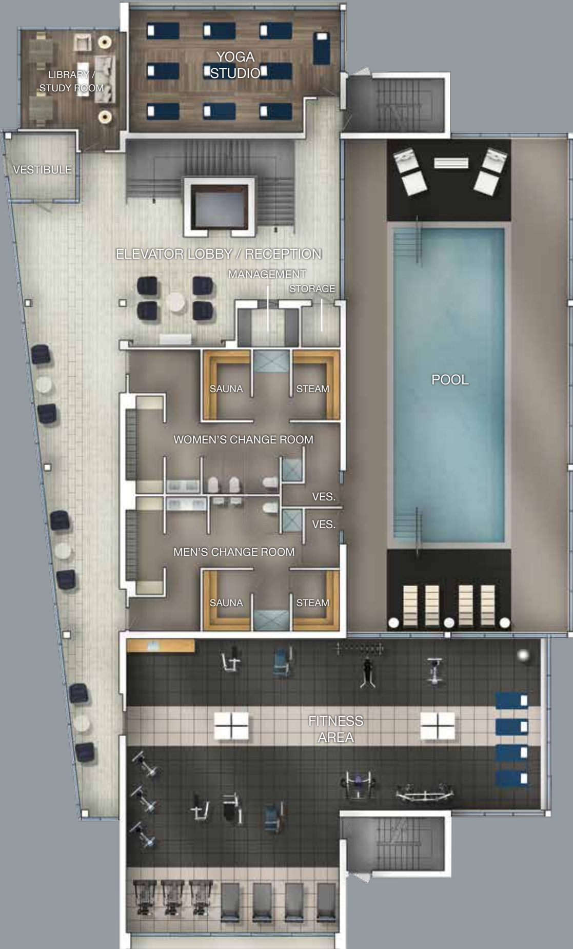
RECREATION BUILDING GROUND FLOOR